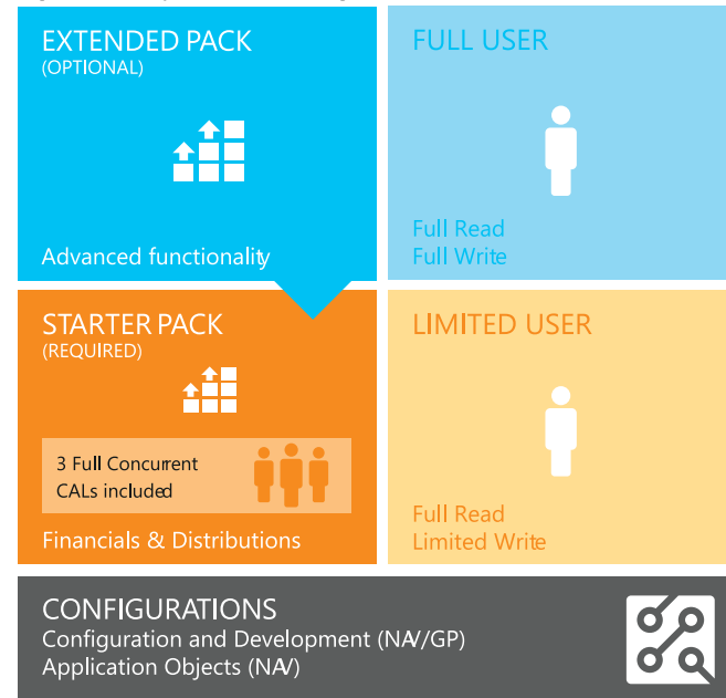
Figure 1: Perpetual Licensing Overview